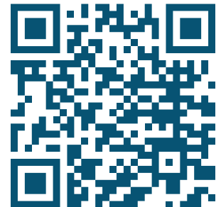
MILL CREEK COMMUNITY FOOD BANK